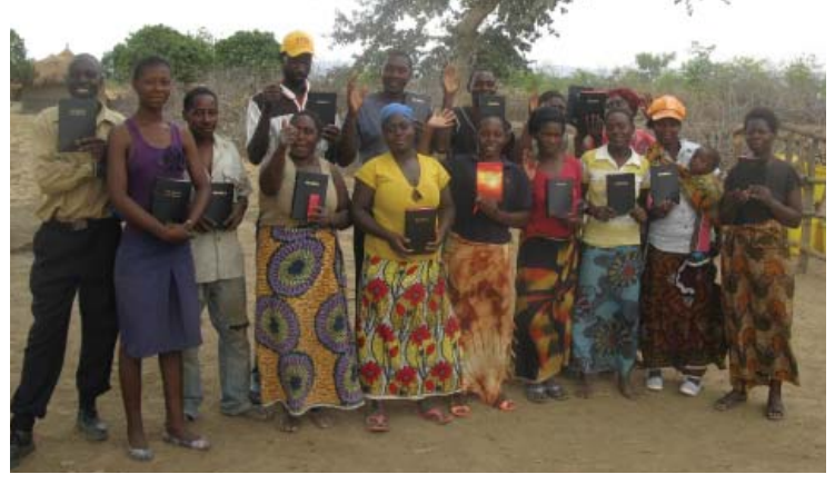
Because of your thoughtful donations, these new believers will start their Christian journey with the written Word!

We have witnessed students, teachers, men, and women come to faith in Jesus Christ through hearing the Word of Christ. Water for the Oppressed (WFTO) continues to preach the Word in the dark and remote areas of Zambia