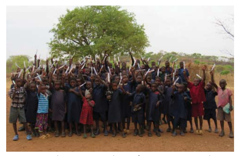
HAPPY Kasaka Primary Students after receiving new shoes and toothbrushes from the Girl Scouts

The mission of WFTO in Zambia is to provide water and the Word in the rural villages. However, we occasionally encounter children and young adults in need of assistance (sponsorship) with school fees (tuition). WFTO cannot assist everyone so we specifically advocate for: orphans, children whose fathers have passed, and students with high marks but unable to afford tuition.