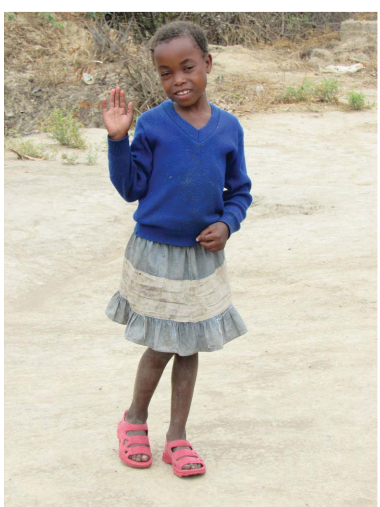
These two children received two of the 240 pairs of shoes donated by the Girl Scouts. The rainy season is beginning and the shoes will protect their feet as they move about the rural villages.

mas are required to bring 15 gallons of water with them as they prepare to give birth. The nearest hand pump is located at a nearby school but it is not working properly. Did we mention that the clinic and school are located at the top of the hill and the hand pump is down in the valley? What if you are not pregnant but sick and visiting the clinic? If you are sick and visiting the clinic you must bring 5 gallons of water. This is the exact scenario we found in one rural community. In perspective, driving your car to the doctor's office and waiting for an hour seems reasonable, right?